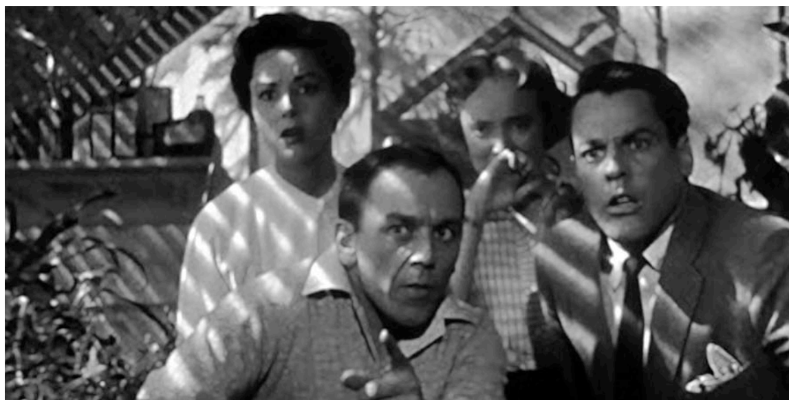
1 Don Siegel, frame from the movie The Body Snatchers , 1956