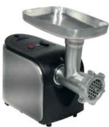
8 Trita Express, R.G.V., 2013