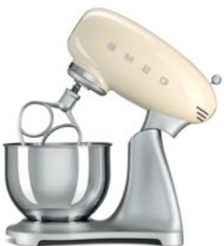
10 Deepdesign (Raffaella Mangiarotti, Matteo Bazzicalupo), SMF01CREU , Smeg, 2014