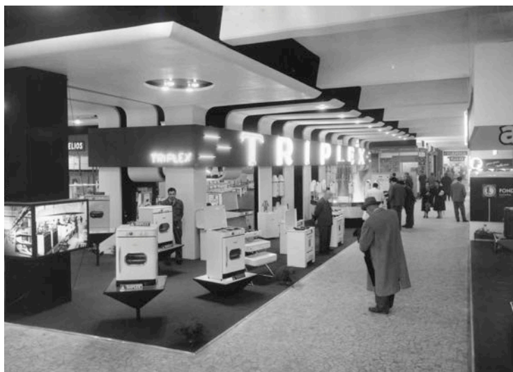
17 Triplex factory at the Pavilion of supplies and equipments for houses, hotels and stores, Fiera Campionaria di Milano (Milan Trade Fair), 1956