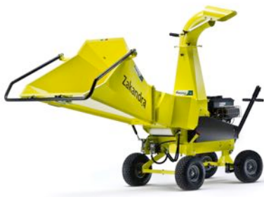
9 Ufficio Tecnico Agrinova, Zakandra , Agrinova, 2015