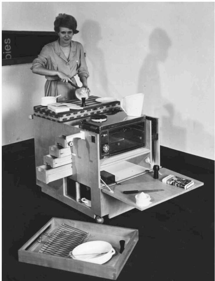
6 Joe Colombo, Minikitchen , Boffi, 1963