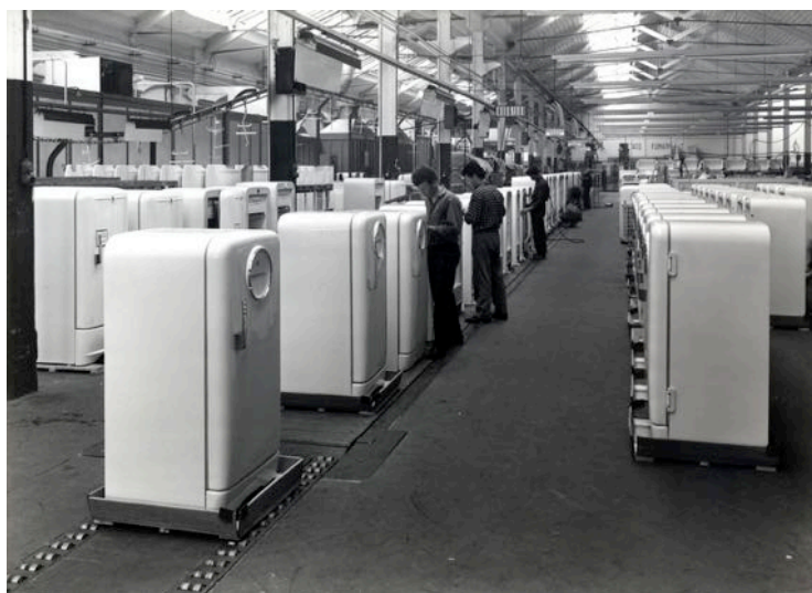
16 Archivio Storico Breda, Refrigerators Assembly Department, Breda Meccanica Bresciana in Brescia, mid 1950's, courtesy Fondazione Isec, Sesto San Giovanni