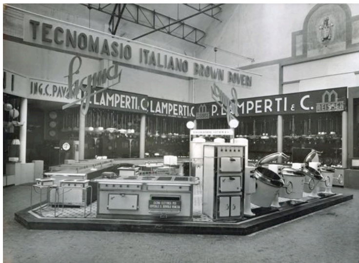
15 Electrotechnics Pavillion, Fiera Campionaria di Milano (Milan Trade Fair). Sigma Kitchens and appliances, by Tecnomasio Brown Boveri, 1936