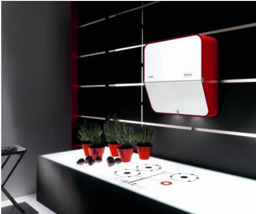
Clip (design Ludovica+Roberto Palomba)