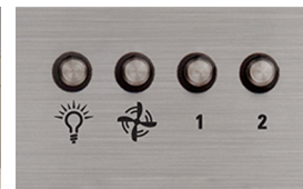
Stainless Steel Push Button Controls