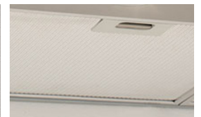
Anodized Aluminum Mesh Filters